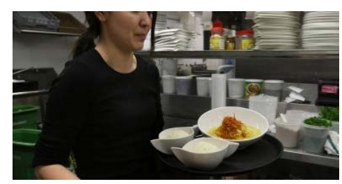
HEALTH CARE /