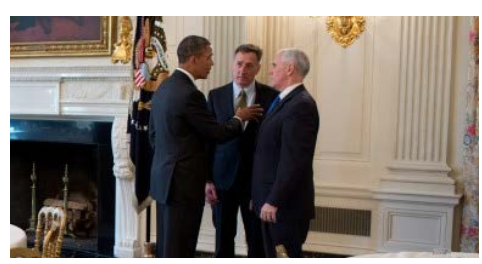
HEALTH CARE /